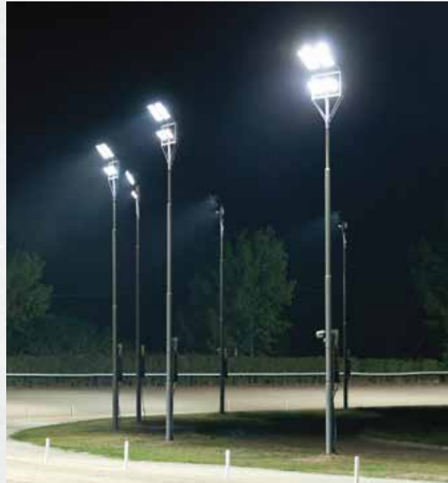
Solar Street Lights

Shivanu is dedicated to providing you with the highest quality Amenities. The finest amenities, delivered by top-match brands that are abend of the game and impeccable facilities that are unrivaled in class and quality!