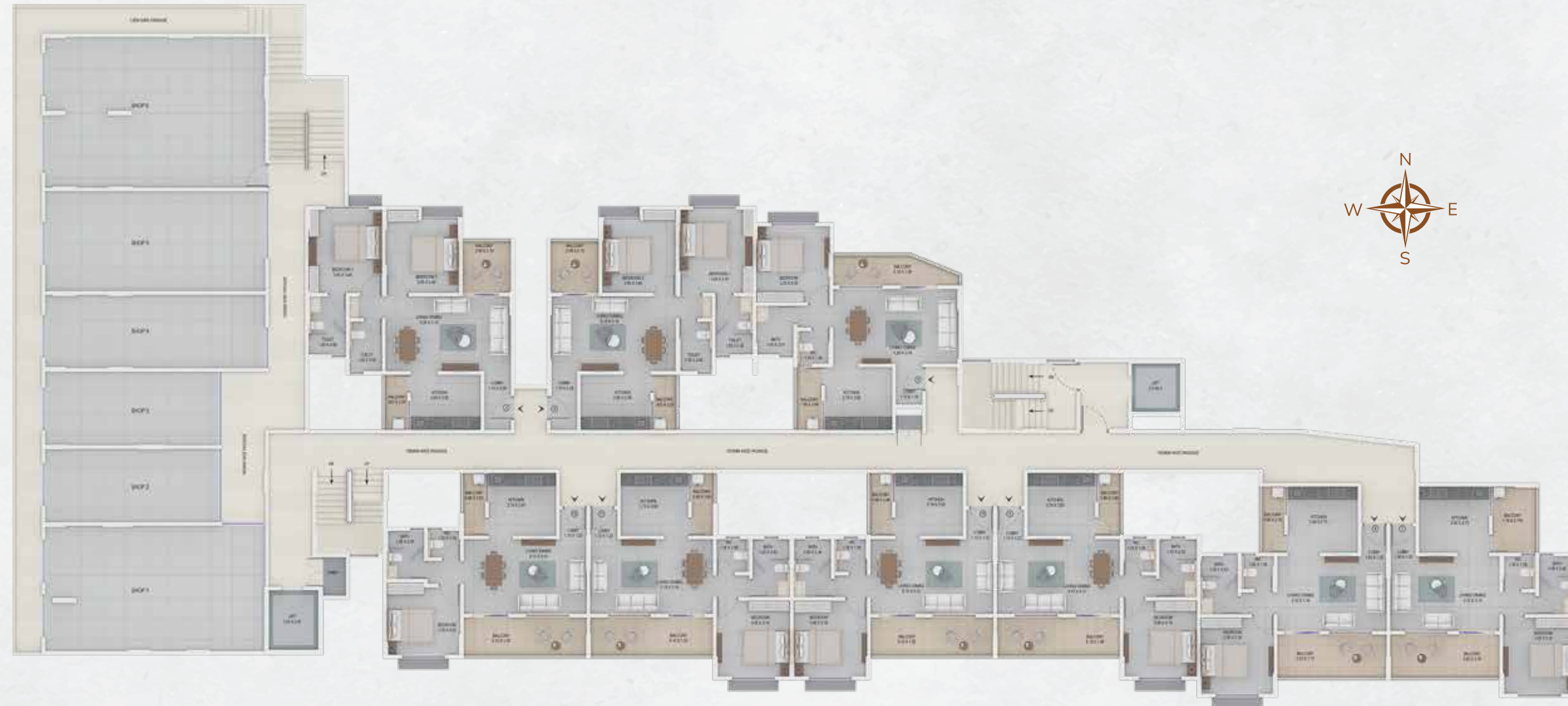
TYPICAL FIRST FLOOR PLAN