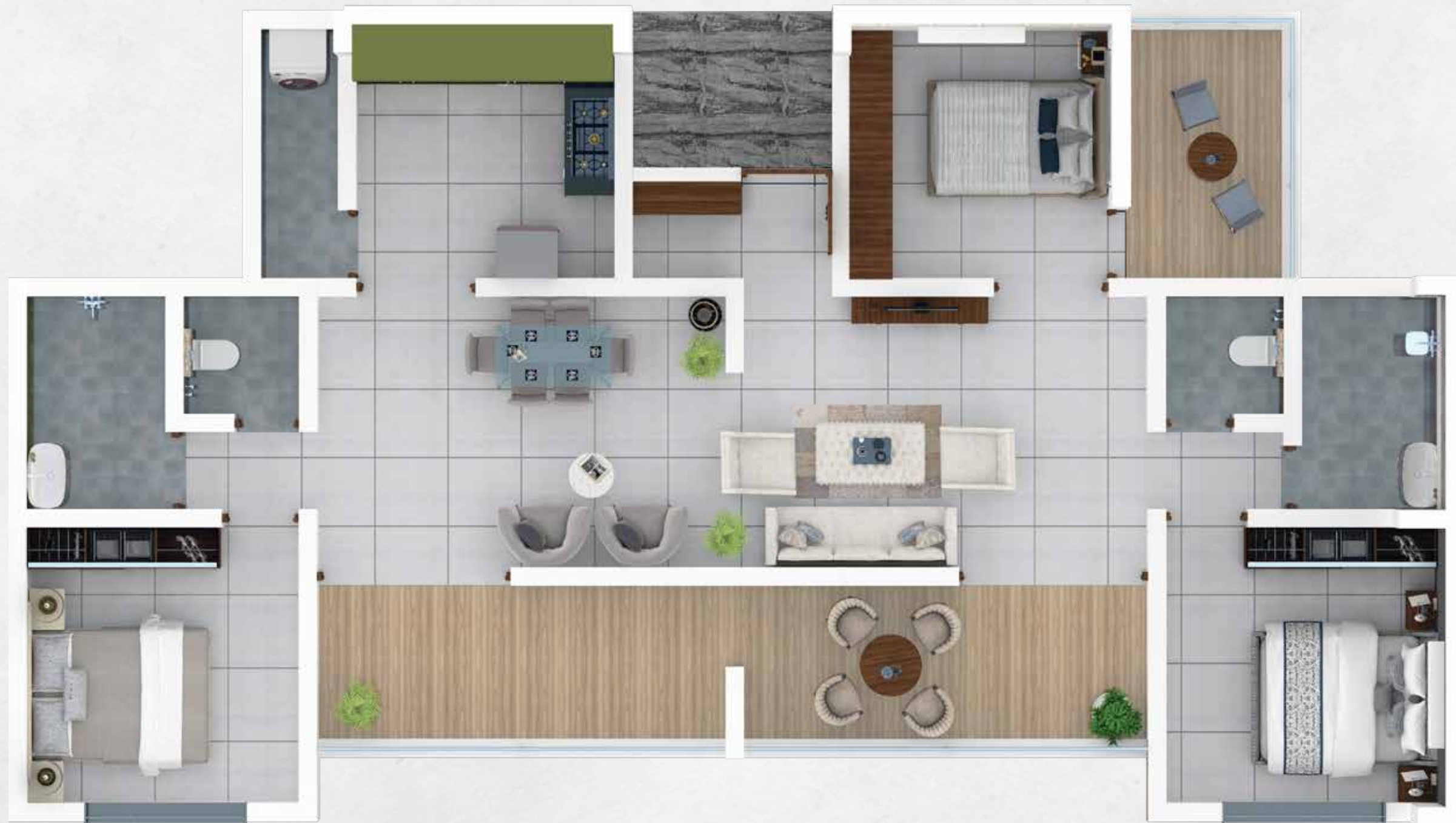
JODI UNITS ( 1 BHK + 1 BHK)