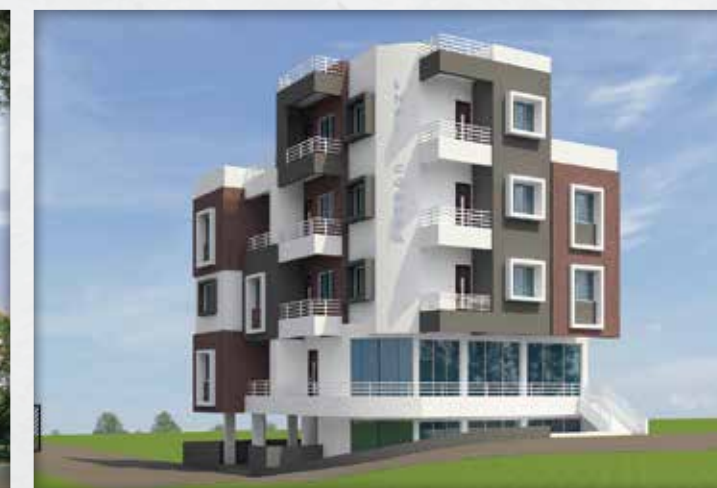
INFI Corner, 950, Shanivar Peth, Satara.