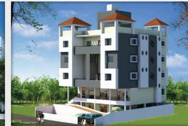
Nakshtra, Machi Peth, Satara.