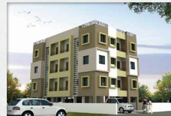
Anant Vihar, Chandan Nagar, MIDC, Satara.