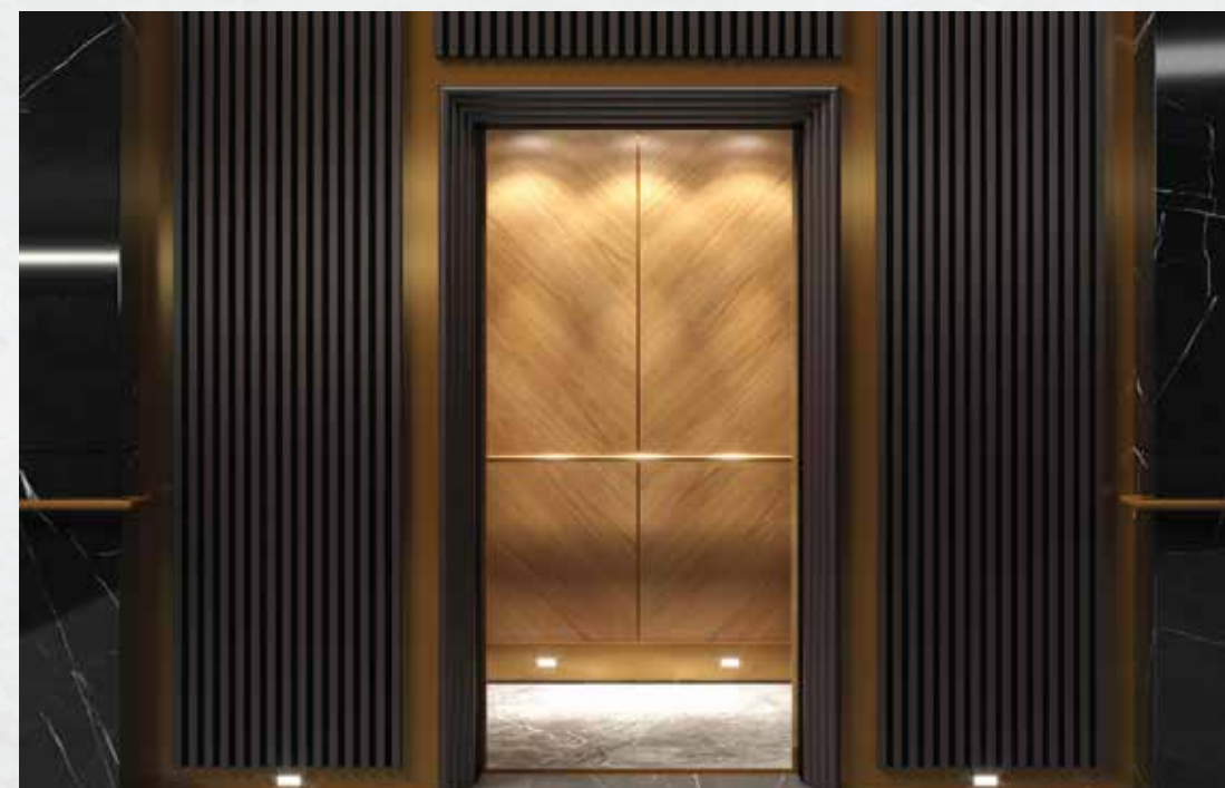
Lift With Battery Backup