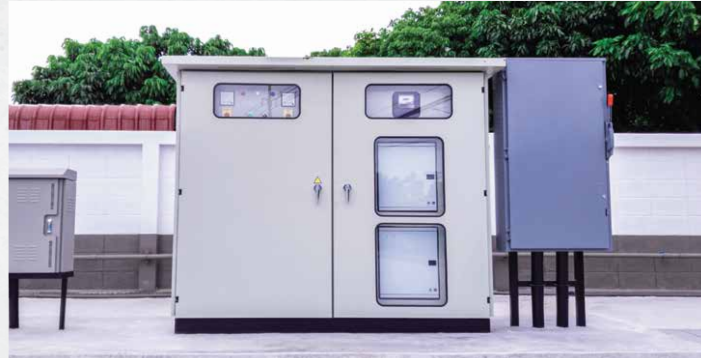
Electric Backups for Common Areas & Lift