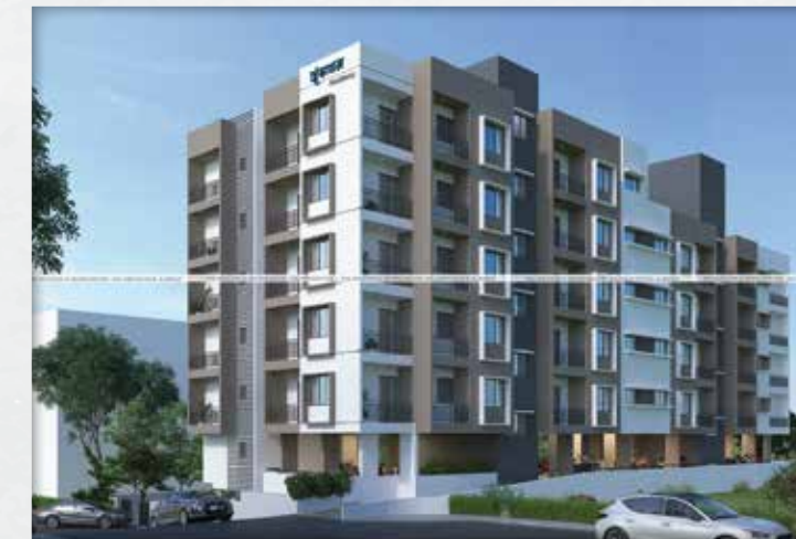
Vrundavan City, Godali, Satara.