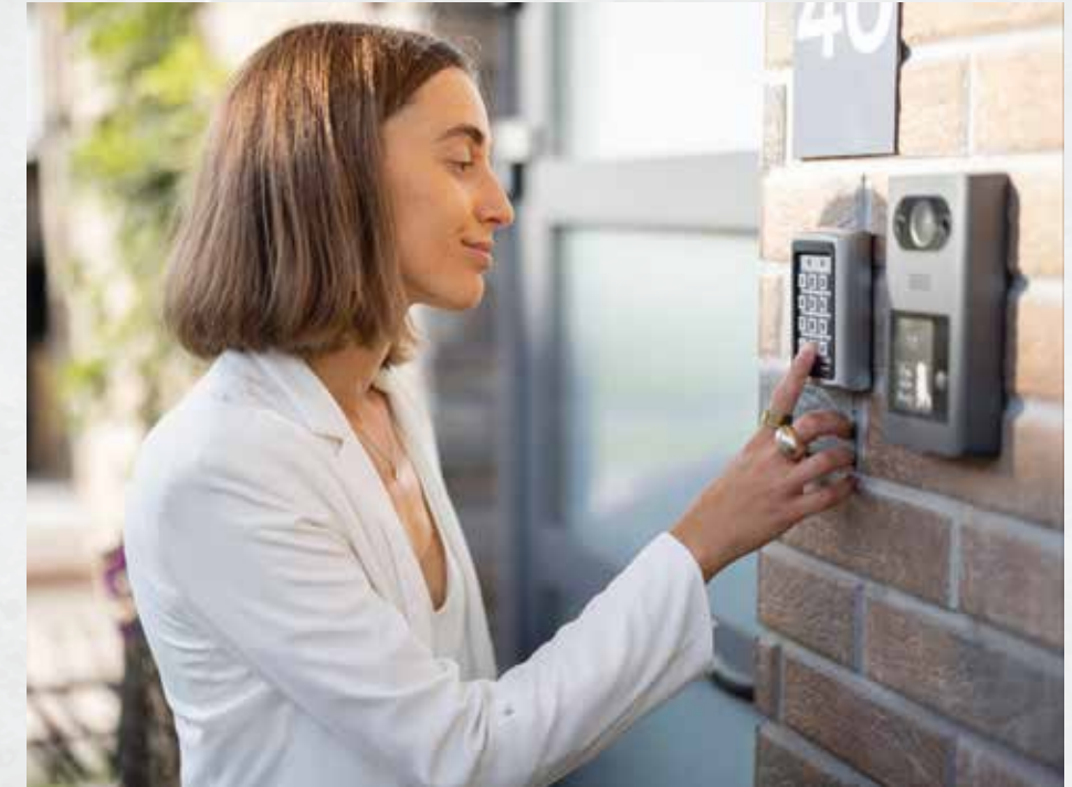
Video Door Bell