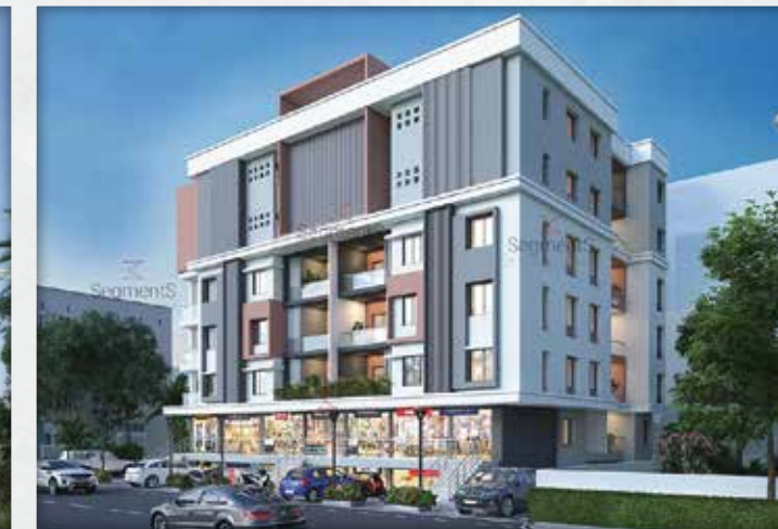
DPS Karishma Park, Shanivar Peth, Satara.