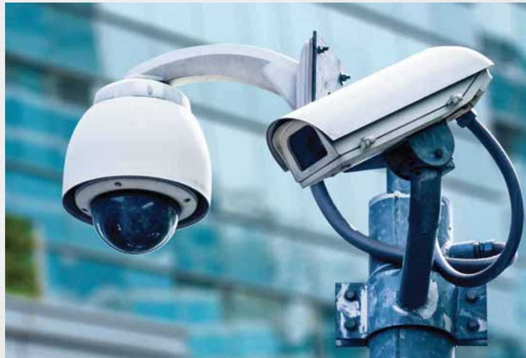
CCTV Security System