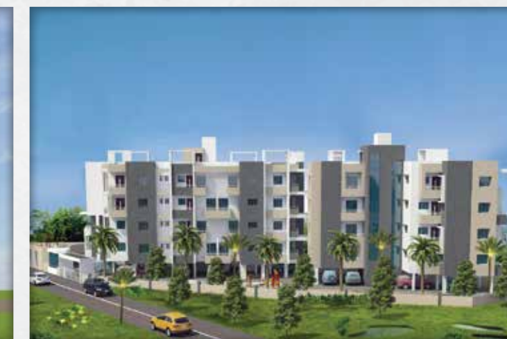
Infinity Homes, Kesarkar Peth, Satara.